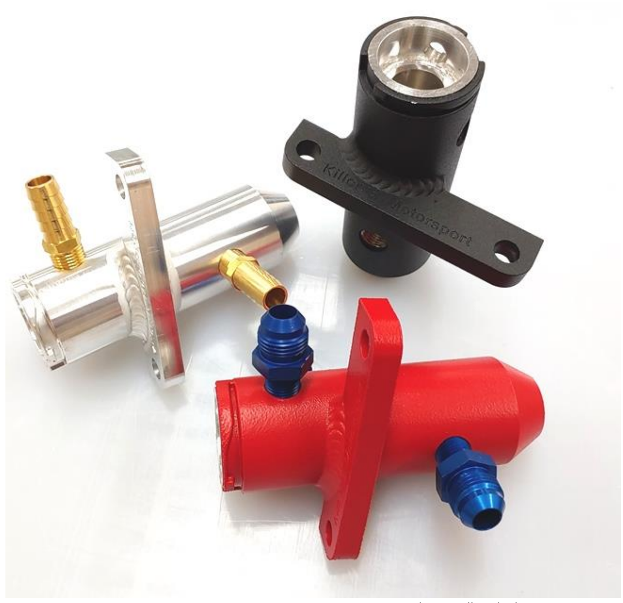
This install took place on a 2019 Sti.