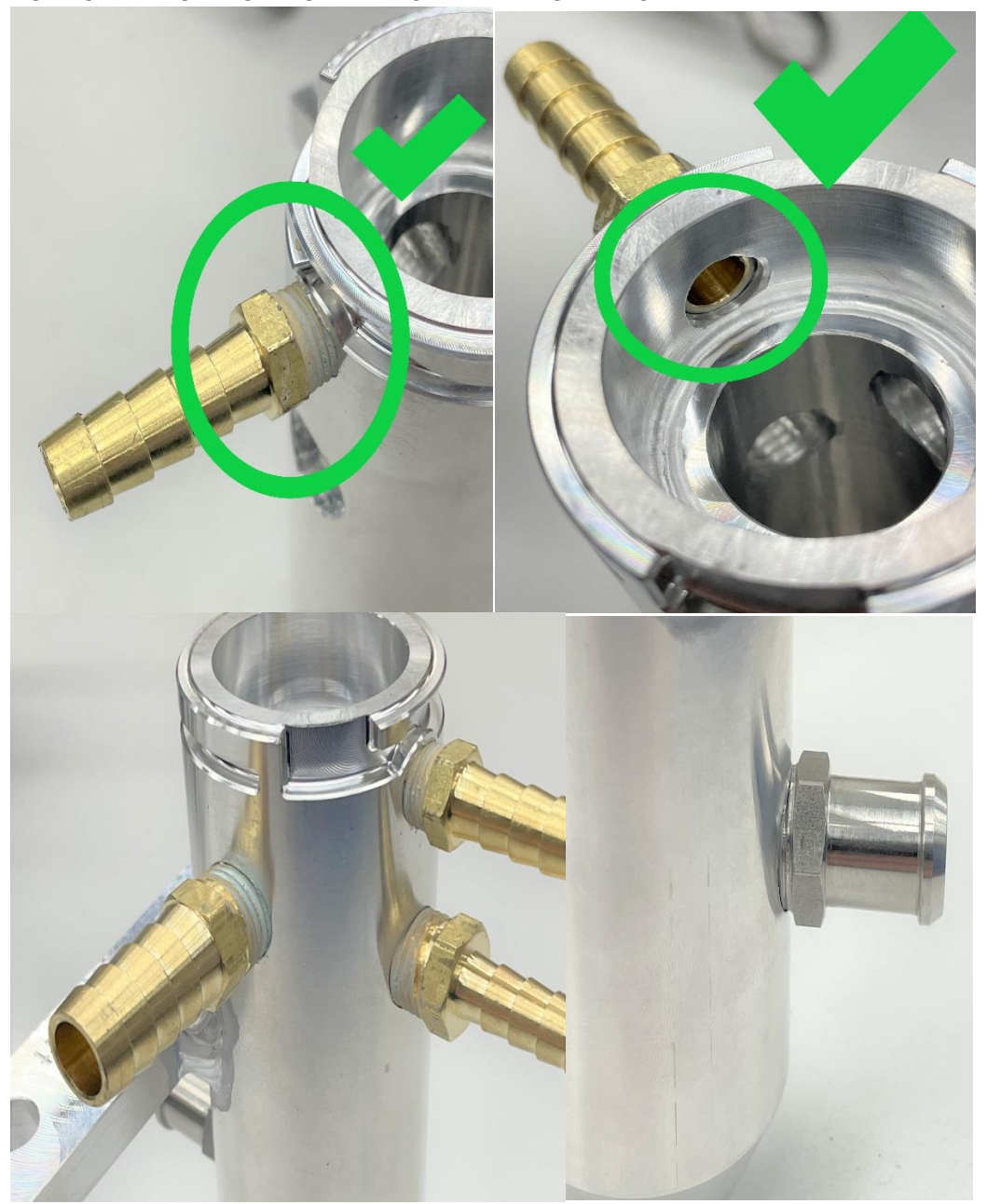
This is what you should expect to see for the final assembly, cap excluded.

***NOTE It is acceptable to tighten the stainless fitting closer into the reservoir because it allows the correct clearance and geometry for the corresponding coolant hose.