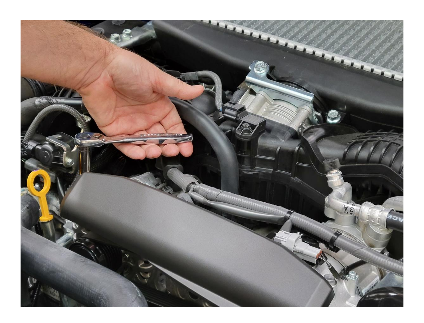
Step 1. Remove Engine Cover